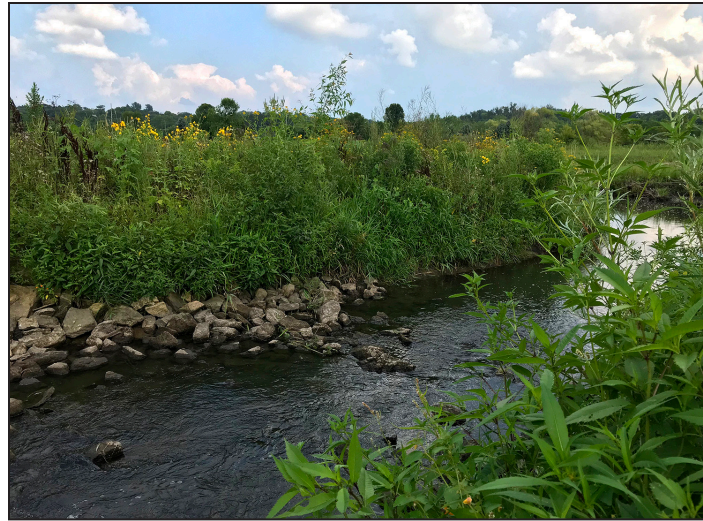
The redesigned South Branch of Cascade Creek mimicked the sinuosity, dimension and shape of a stable channel elsewhere in the watershed.