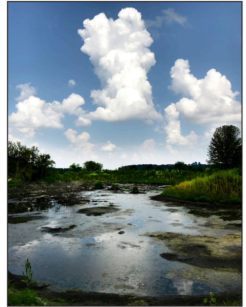
Left: Root wads help to stabilize the banks of the South Branch of Cascade Creek. Middle: Rocks were placed to slow the water, create habitat and stabilize the streambed of the South Branch of Cascade Creek. Curves were designed to help curb the velocity. Right: Wetlands eventually will fill with water. Logs and roots will help to create habitat. Engineers hope the wetlands will distract beavers and keep them from damming the creek.

could connect to 180-acre Cascade Lake Park via bike trail.