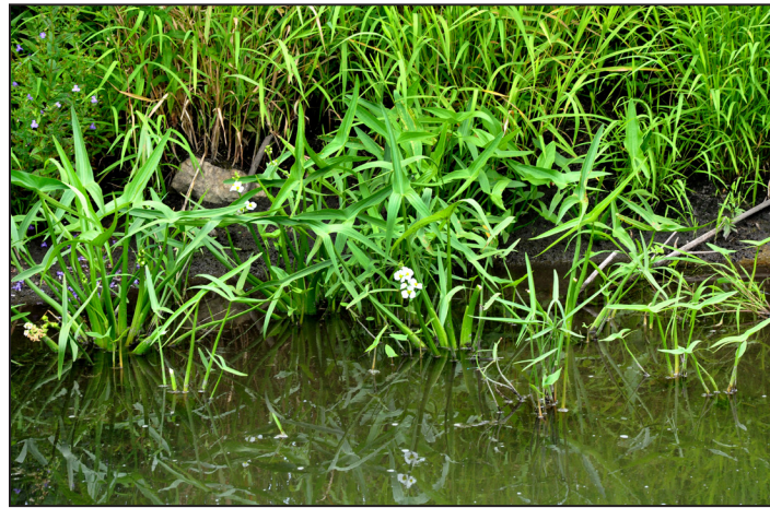
Aquatic plants bloomed in mid-August in the South Branch of Cascade Creek in Rochester. The restoration also included upland prairie plantings.

wetlands for turtles, the unmowed native grass. She requested a list of plants to relay in a newsletter.